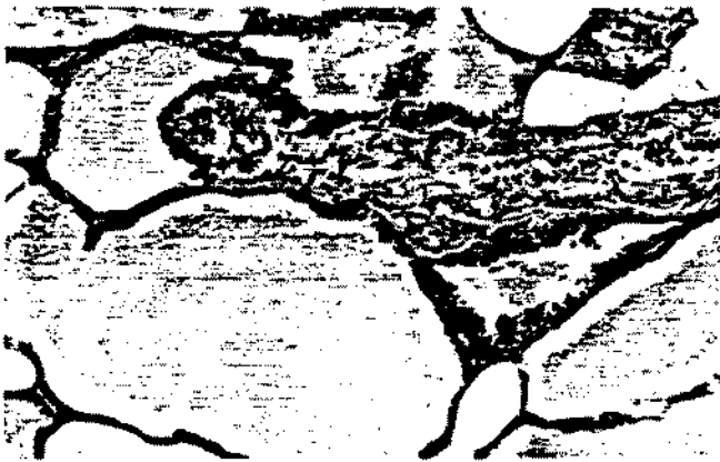
Fig 5.—Rat breast, 52 weeks old (group 3, perchlorate blockade). Another site of epithelial atypia associated with prominent cystic alteration. Almost entire lining of pyramidal cyst in center is involved (hematoxylin-eosin, \times 252 ).