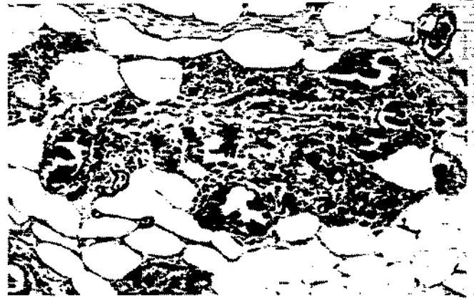
Fig 2.—Rat breast, 42 weeks old (group 2, perchlorate blockade). Striking focal calcifications are noted at duct and lobular levels with pattern further obscured by fibrous tissue encroachment (hematoxylin-eosin, \times 252 ).