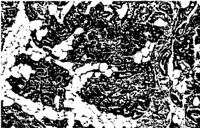
Fig 3.—Rat breast, 52 weeks old (group 3, perchlorate blockade). Intralobular fibrous tissue proliferation resembling sclerosing adenosis of human (hematoxylin-eosin, \times 168 ).