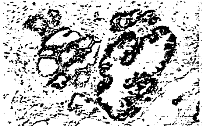
Fig 4.—Rat breast, 52 weeks old (group 3, perchlorate blockade). Atypia is present in microcystic site with disturbed polarity, piling-up of cells, and attainment of papillomatous character (hematoxylin-eosin, \times 252 ).